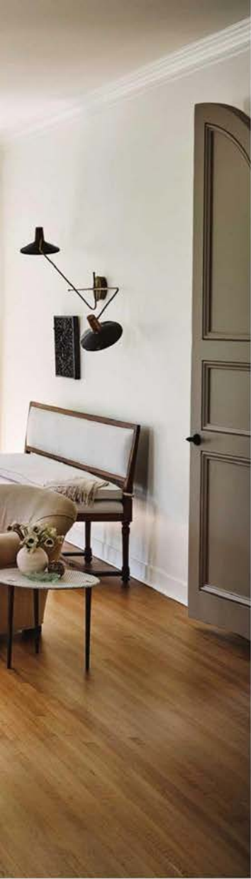
LEFT IN THE LIVING ROOM, A SOFA BY AFRA AND TOBIA SCARPA FOR CASSINA, A CIRCA-1950 ITALIAN CHAIR, AND A PAIR OF 1940S LINEN CLUB CHAIRS SURROUND A MARBLE COCKTAIL TABLE FROM HOLLYWOOD AT HOME. A 1950S ITALIAN SCONCE HANGS ABOVE A 1960S ENGLISH BENCH COVERED IN A LEE JOFA FABRIC; BELGIAN LINEN CURTAINS BY RH.

“When you live with a small child, you don’t want to feel beholden to your possessions.” —Nate Berkus