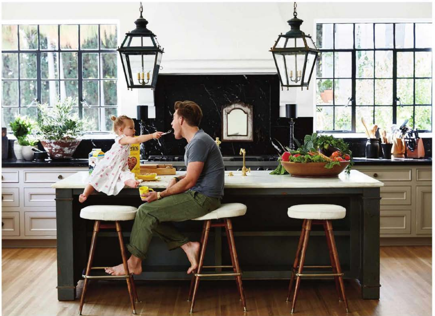
BRENT AND POPPY (WEARING A D. PORTHAULT DRESS) AT THE KITCHEN ISLAND; CIRCA-1960 FRENCH BARSTOOLS; SINK FITTINGS BY WATERSTONE; 19TH-CENTURY FRENCH LANTERNS. BACKSPLASH AND SURROUNDING COUNTERTOPS BY OLLIN STONE; WHITECHAPEL BRASS KNOBS.