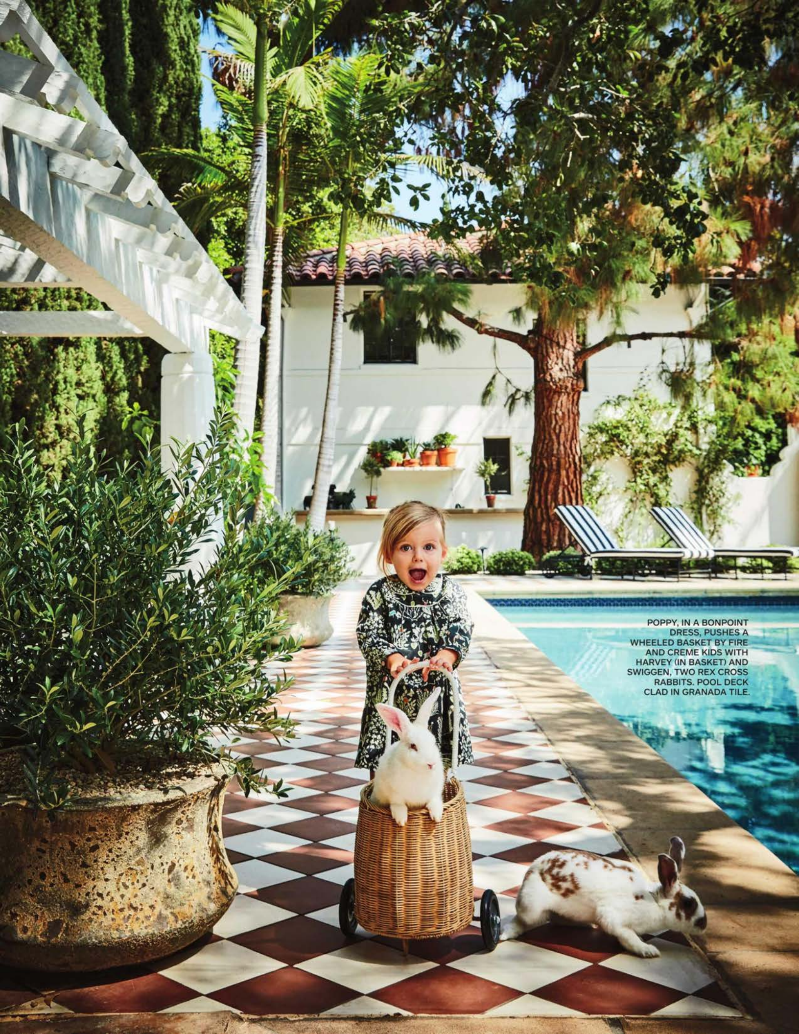
POPPY, IN A BONPOINT DRESS, PUSHES A WHEELED BASKET BY FIRE AND CREME KIDS WITH HARVEY (IN BASKET) AND SWIGGEN, TWO REX CROSS RABBITS. POOL DECK CLAD IN GRANADA TILE.